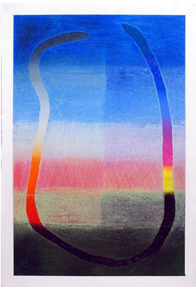
Rural Parking Lots Pastel on cotton rag paper 2020 22 x 15 inches (unframed) Contact Gallery for Price FLX2020RJ3

2251 SOUTH MICHIGAN AVE, SUITE 220 / CHICAGO, IL / 60616