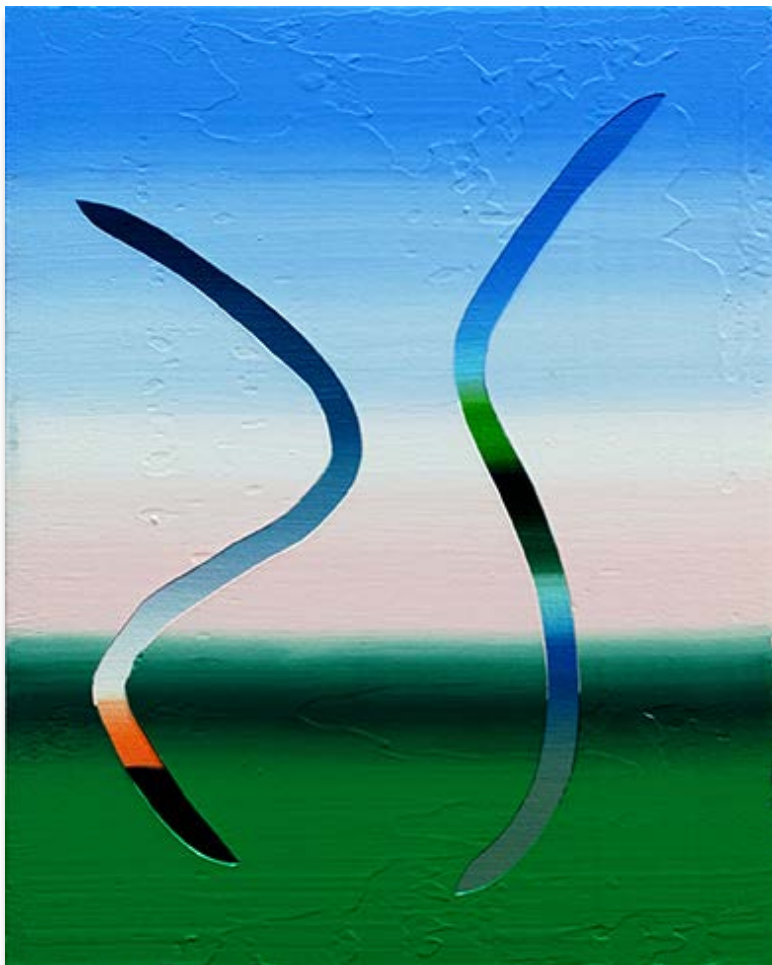
Rural Parking Lots 2

2251 SOUTH MICHIGAN AVE, SUITE 220 / CHICAGO, IL / 60616