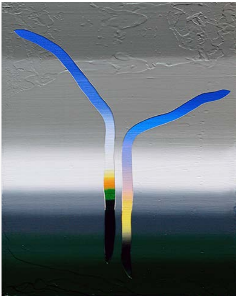
2 Verticals Divided (After Raoul De Keyser)

2251 SOUTH MICHIGAN AVE, SUITE 220 / CHICAGO, IL / 60616