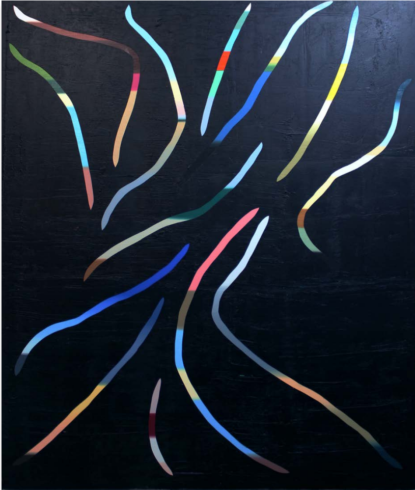
The Sound of Fate Knocking at the Door (New York and New Orleans)

2251 SOUTH MICHIGAN AVE, SUITE 220 / CHICAGO, IL / 60616