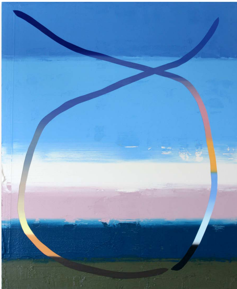
Paths Cross (North End)

2251 SOUTH MICHIGAN AVE, SUITE 220 / CHICAGO, IL / 60616